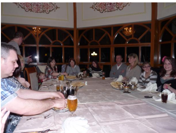
“I’m sure I can get more Wotsits in my hands!!”